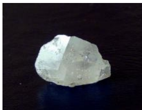
Phenakite South Baldface, North Chatham

New England and especially New Hampshire is rich in beryllium that results in over 20 mineral species occurring in the state. Many of the species are rare and rival the best in the world. Beryllium is a metal and is crucial to many of our modern day products which is why beryl (a beryllium ore) was chosen to be the State mineral in 1985.