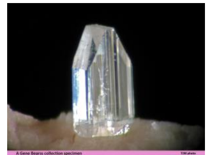
A Gene Beards collection specimen